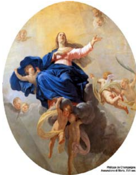
Philipp de Champaigne, Assunzione di Maria, XVI sec.