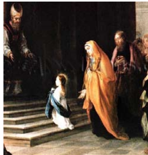
The Presentation of the Blessed Virgin Mary (Mary enters the Temple) 21 November