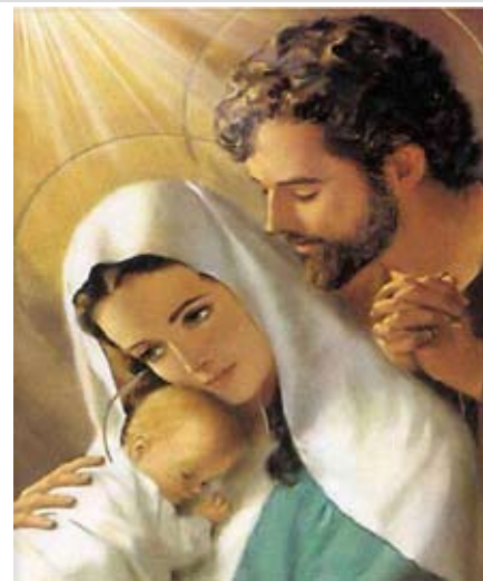
Wishing you all Christmas blessings!