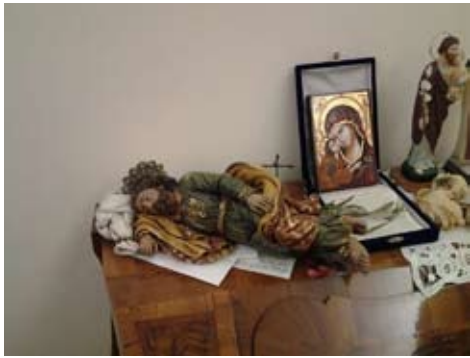
Pope Francis' statuette of Dormant St Joseph

3. Be prophetic voices within our communities. St. Joseph heeded the voice of the Angel and responded to God's call... and together with Mary he was a model for the child Jesus during his growing years. When families have children, and train them in the faith and sound values, and teach them to contribute to society, they become a blessing in our world. God's love becomes present and active by the way we love and by the good works we do. Thus we extend Christ's kingdom in this world.