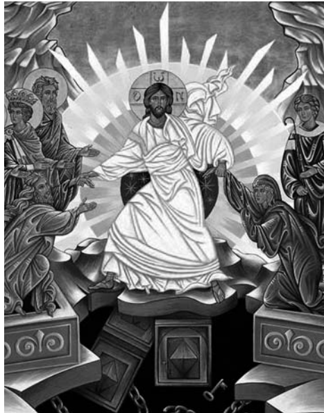
The Lord is enthroned as King for ever! Icon Cenacolo Community Medjugorje

We need to wake from our sleep, from the torpor of death that lurks beneath a showy and apparent efficiency. 'Tis Easter. Let us rise again in Christ! §