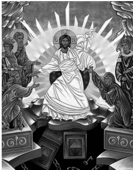
The Lord is enthroned as King for ever! Icon Cenacolo Community Medjugorje

We need to wake from our sleep, from the torpor of death that lurks beneath a showy and apparent efficiency. 'Tis Easter. Let us rise again in Christ! §